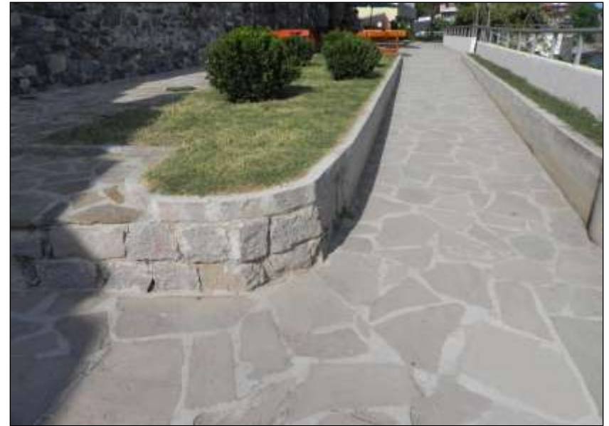
Ramps along the Southern panoramic alley