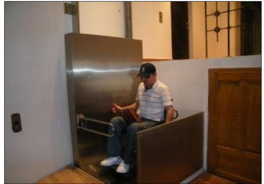
Lifts for people with disabilities at Southern Fortress Wall and Tower Architectural and Historic Complex and the Municipal Ethnographic Museum