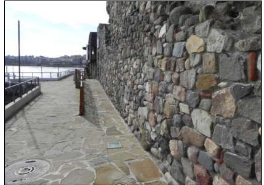
Ramps to Southern Fortress Wall and Tower Architectural and Historic Complex and to the Municipal Ethnographic Museum