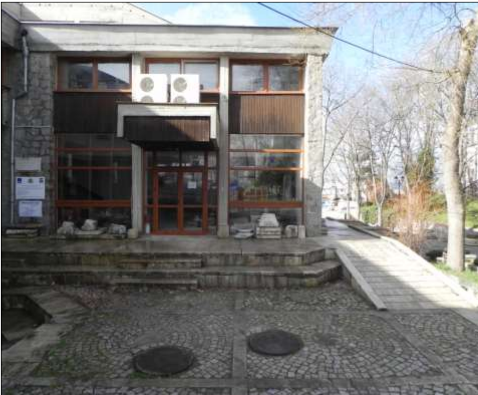
Ramp to the entrance of the Archaeological museum of Sozopol

5. Providing access for people with disabilities to the Archaeological Museum and to St. Cyril and St. Methodius Orthodox Church, where the relics of St. John the Baptist are exhibited for worship. The project was implemented in 2012.