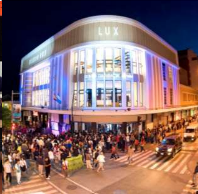
Cultural Center of Spain in Guatemala City (Guatemala)