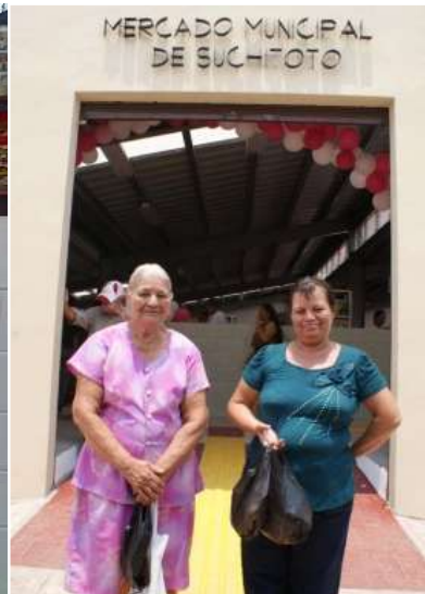
Restoration of Suchitoto's Market (El Salvador)